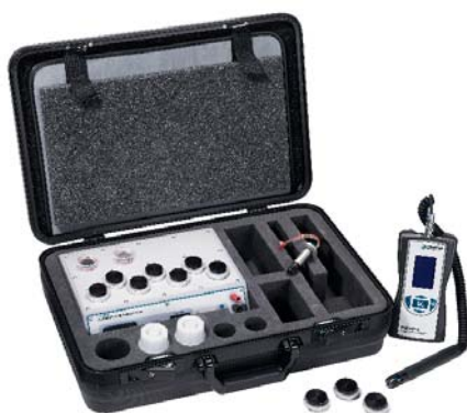
S503 in case with MDM25 Handheld Hygrometer