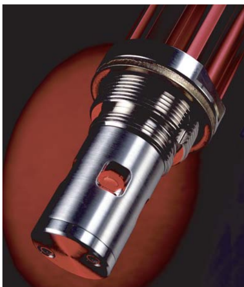
Optional 316 SS sensor housing for applications with high corrosives

A number of different corrosion resistant mirror and sensor housing materials are available, to withstand aggressive sample components in the harshest of applications. High temperature (up to 130°C) and high pressure (up to 250 barg) sensor versions are available. Michell's technical team are always available to advise on the most appropriate choices for your process.